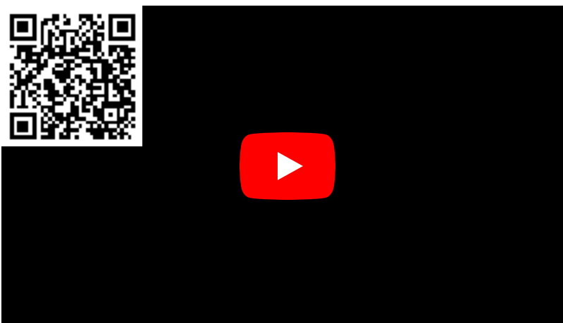
Video 3.7.1: This is a nice little demonstration showing the Conservation of Mass in action.

The law of conservation of mass was created in 1789 by a French chemist, Antoine Lavoisier. The law of conservation of mass states that matter cannot be created or destroyed in a chemical reaction. For example, when wood burns, the mass of the soot, ashes, and gases equals the original mass of the charcoal and the oxygen when it first reacted. So the mass of the product equals the mass of the reactant. A reactant is the chemical reaction of two or more elements to make a new substance, and a product is the substance that is formed as the result of a chemical reaction (Video 3.7.1). Matter and its corresponding mass may not be able to be created or destroyed, but can change forms to other substances like liquids, gases, and solids.